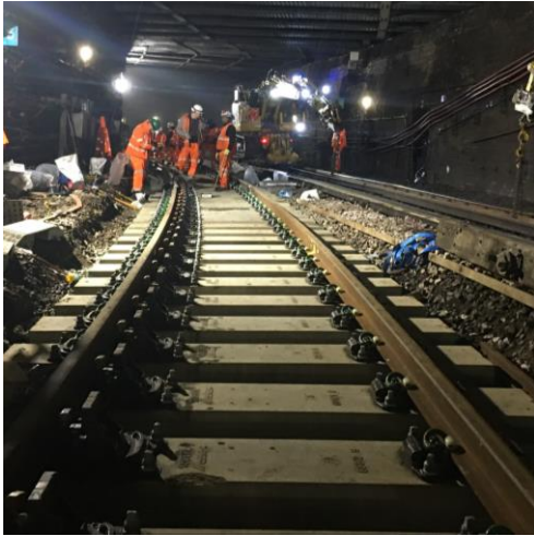
Figure 2: BTR near Hammersmith