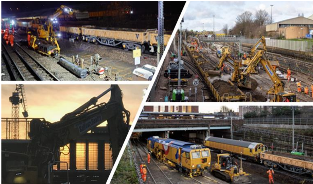
Figure 3: Acton Town P&C Renewal, Christmas 2020