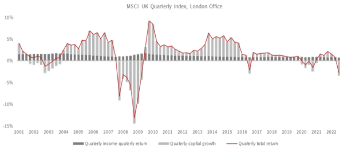
Chart 1: Income return, capital growth and total return associated with holding central London offices over last 20 years

3.3 The chart shows that, although the returns associated with holding central London offices are volatile, that volatility is driven largely by changes in capital value. Income return over the last 20 years has been relatively stable, with a quarterly average of 1.1 per cent.