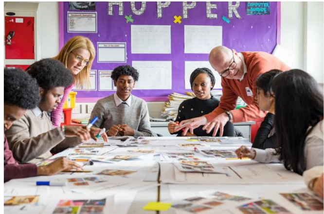
Picture 1: depicting six Ark Academy students being led by two facilitators, sat around a table.

Through the EEP, we have built relationships with secondary schools very local to the sites, Kidbrooke Square and Wembley Park. Working closely with the Design and Quality team in Property Development, we have developed a set of engagement resources to engage young people, particularly teenage girls, in the design process for children's play space we are obliged to deliver as part of our developments.