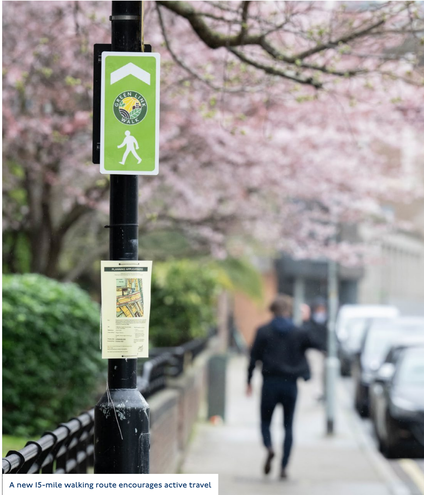
A new 15-mile walking route encourages active travel

Since the pandemic, London has seen a 10 per cent increase in leisure walking, and according to our Leisure Walking Plan, 57 per cent of Londoners want to see more space in London dedicated to walking.