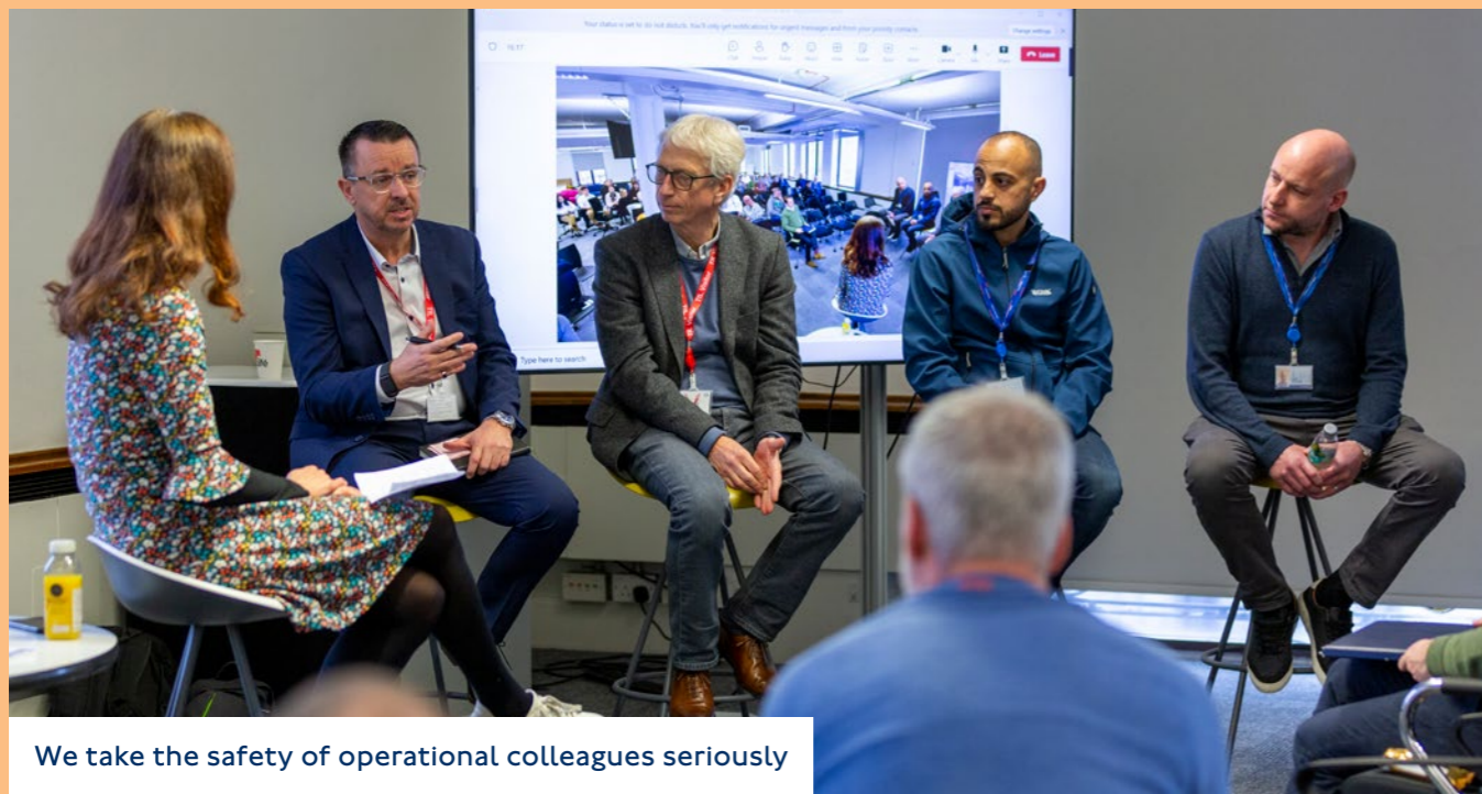
We take the safety of operational colleagues seriously

On 25 April, Places for London, our property arm, held its first stand-down day at our head office at Victoria station. The event was well attended, with over 200 colleagues participating in a series of sessions where their safety achievements were acknowledged and shared, and safety goals were reiterated. The links between safety and health are well known, so the event also took time to consider ways to maintain and improve colleague wellbeing as well as a reminder of the impact Places for London has on the safety and wellbeing of our customers too.