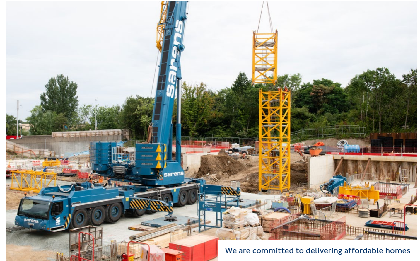
We are committed to delivering affordable homes

On 17 April, the new Places for London brand won two highly prestigious Gold Awards at the European Transform Awards for best visual identity under the public and property sector categories. The judges commented that the new identity is ‘a