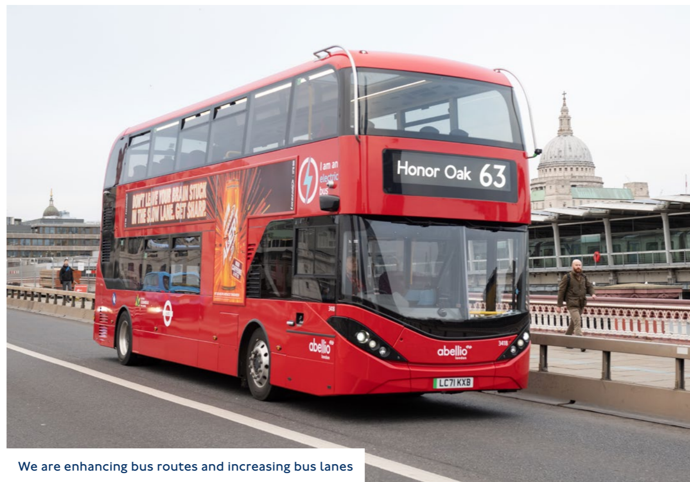
We are enhancing bus routes and increasing bus lanes

The new bus lanes delivered in 2023/24 contribute towards our target of 25km of new bus lane by 31 March 2025, in accordance with the Department for Transport's condition on TfL funding.