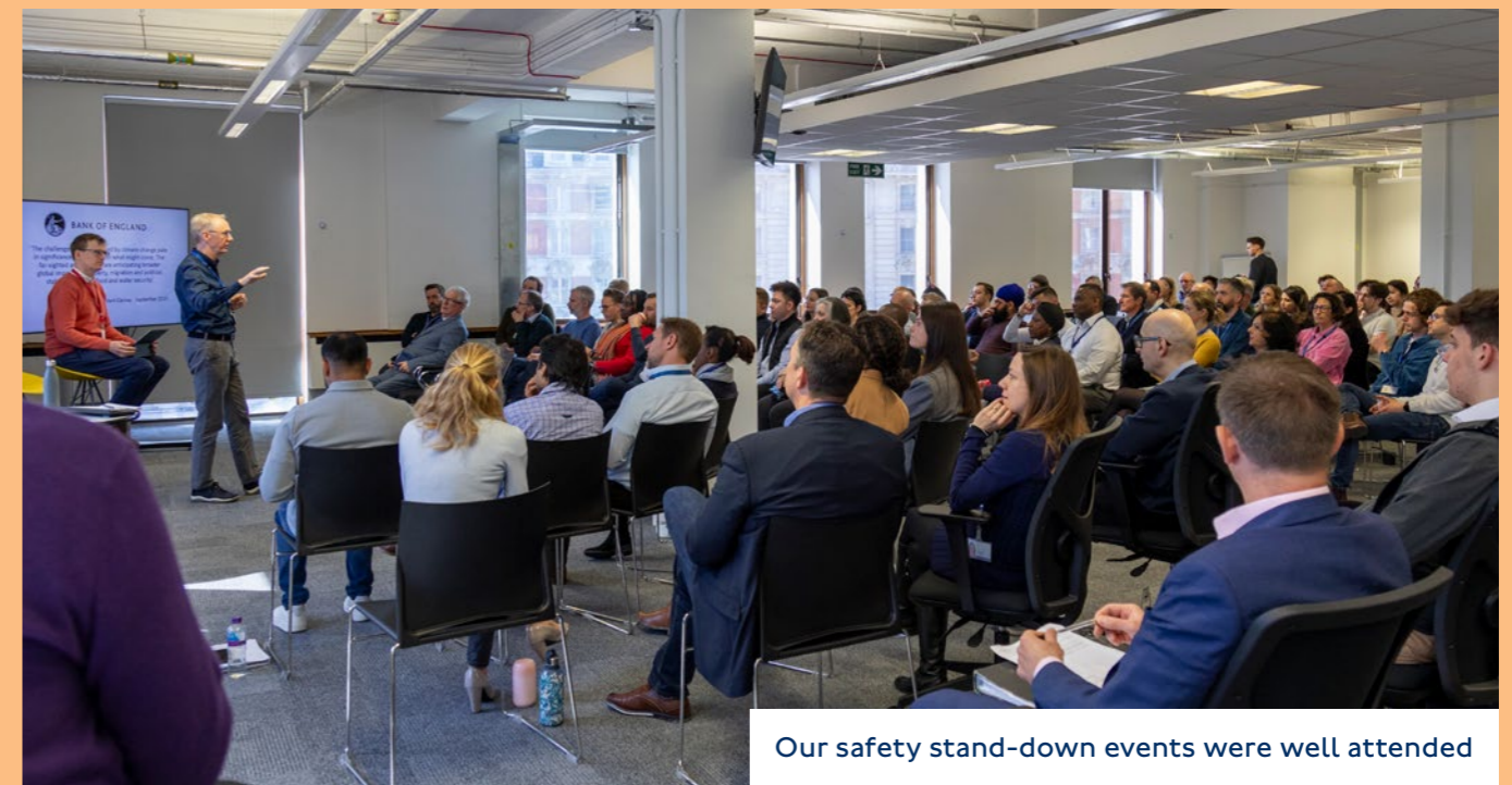
Our safety stand-down events were well attended