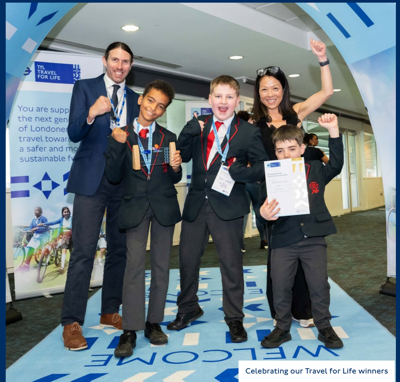
Celebrating our Travel for Life winners

671 London schools awarded TfL Travel for Life gold accreditation