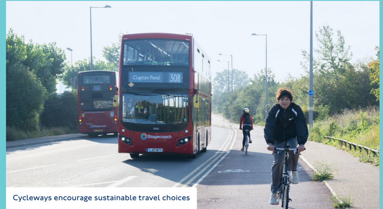
Cycleways encourage sustainable travel choices

For the period ending 10 March 2024, 95,000 trips were made, taking this to a total of 3.8 million trips. In April 2024, Dott withdrew from the trial due to financial pressures and steadily declining ridership, despite trips for the trial increasing overall. Recent publication in the London E-scooter Rental Trial report (phase I) showed that in current trial conditions rental e-scooters have the potential to contribute positively to the aims of the Mayor's Transport Strategy.